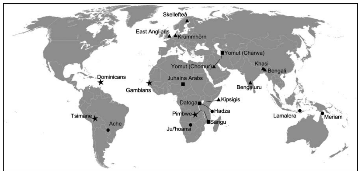
Fig. 1. Populations studied. Note: Circle indicates hunter-gatherers; star, horticulturalists; square, pastoralists; and triangle, agriculturalists.

Ideally, one would have comparable measures of the relative importance ( \alpha ) and degree of transmission ( \beta ) of each class of wealth, the degree of inequality in the distribution of each kind of wealth (Gini), and the extent of wealth shocks ( \sigma_\lambda^2 ). Measuring the last-mentioned is difficult in any economy and impossible in the economies under study, as the estimate requires long time-