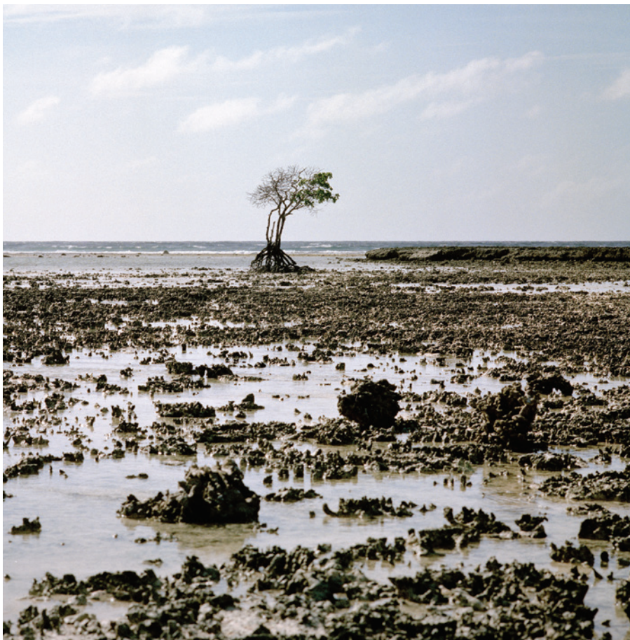
This former mangrove forest once provided benefits such as storm protection and carbon sequestration.