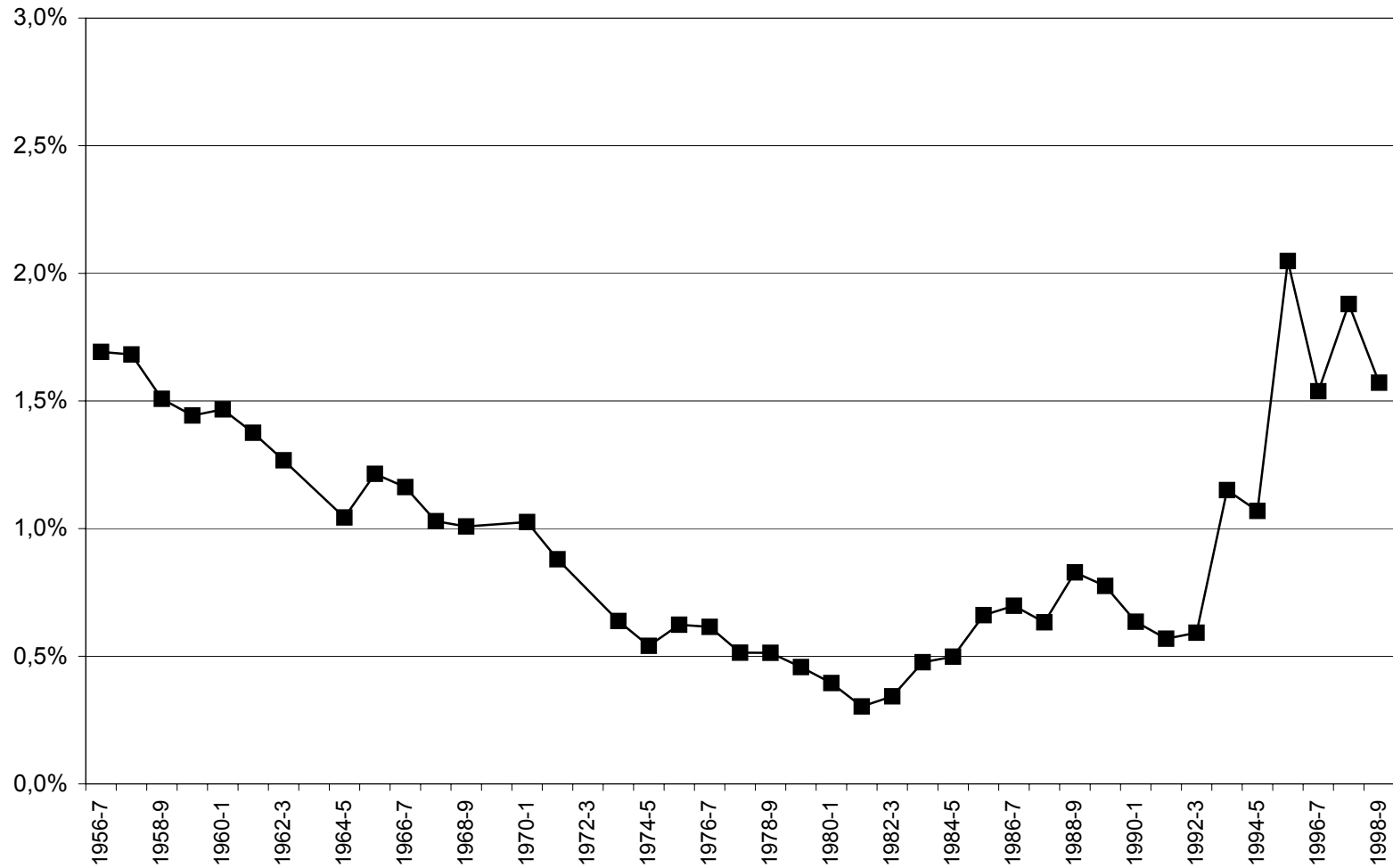
Figure 1 : The top 0,01% income share in India, 1956-2000